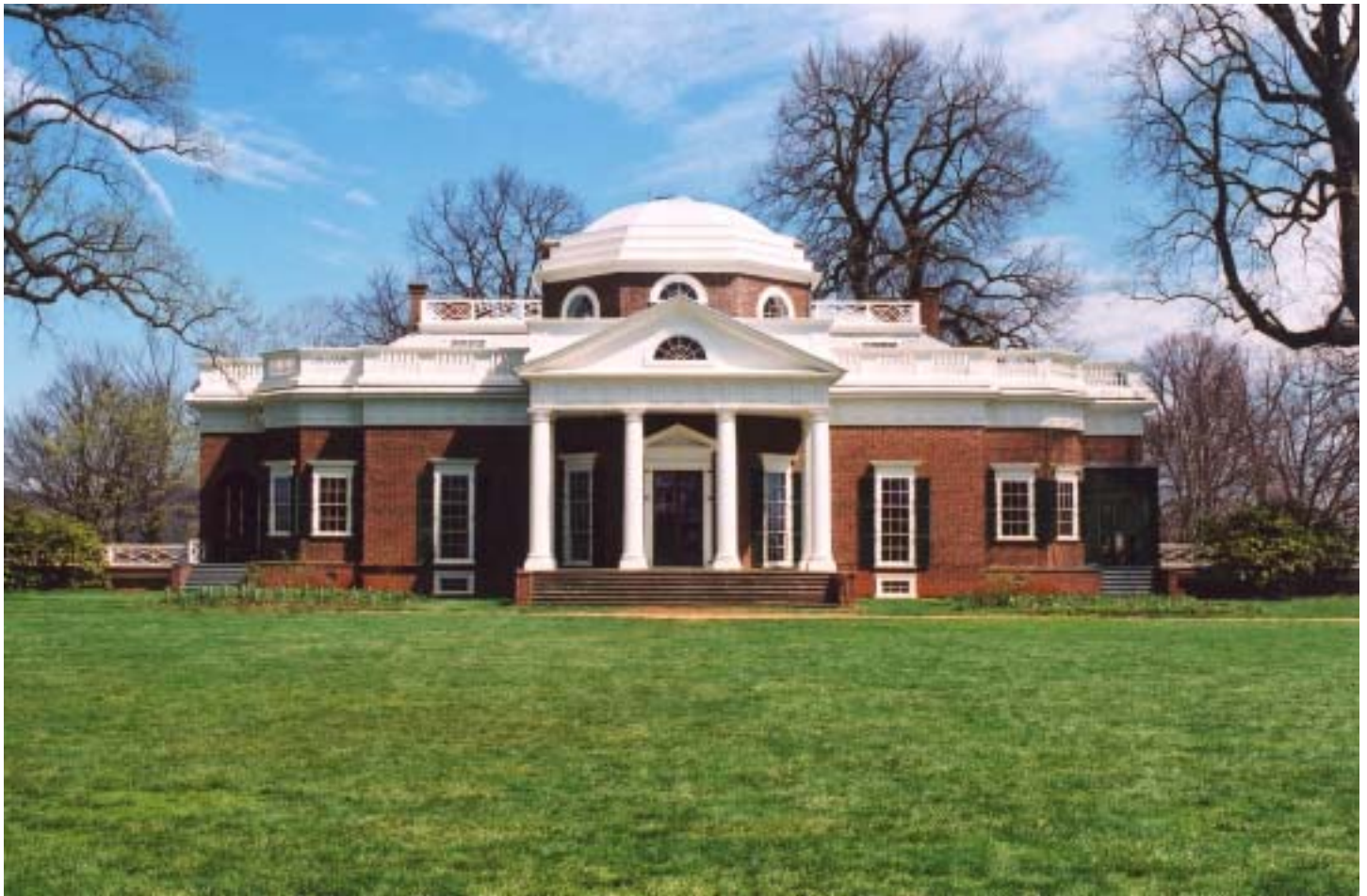
Monticello, Virginia home of Thomas Jefferson. The Lewis & Clark Trail starts here on the front steps of Monticello. President Thomas Jefferson selected his Virginia neighbor, Meriwether Lewis, as his personal secretary and to lead the expedition. Lewis prepared for the journey under Jefferson's tutelage in North American geography, botany, mineralogy, astronomy, and ethnology. Prior to departing for St. Louis in 1803, Capt. Clark studied under America's leading scientists in Philadelphia.

"As soon as Jefferson learned that Louisiana was to be ceded to France [by Spain], he moved to settle the Mississippi question permanently. He directed the American minister to France, Robert R. Livingston, to open negotiations for the purchase of New Orleans, or failing that for the right of deposit or some other means of temporarily saving the situation. Napoleon's foreign minister, Talleyrand, completely frustrated Livingston, refusing to come to grips with his proposals.... -- Bernard DeVoto