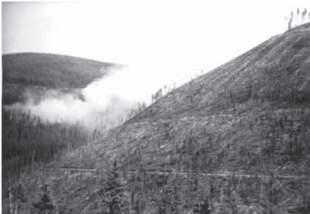
Plum Creek clearcutting near Lolo Pass, 1989.

"I had been assured that the trail was being taken into consideration and that's exactly what we found."