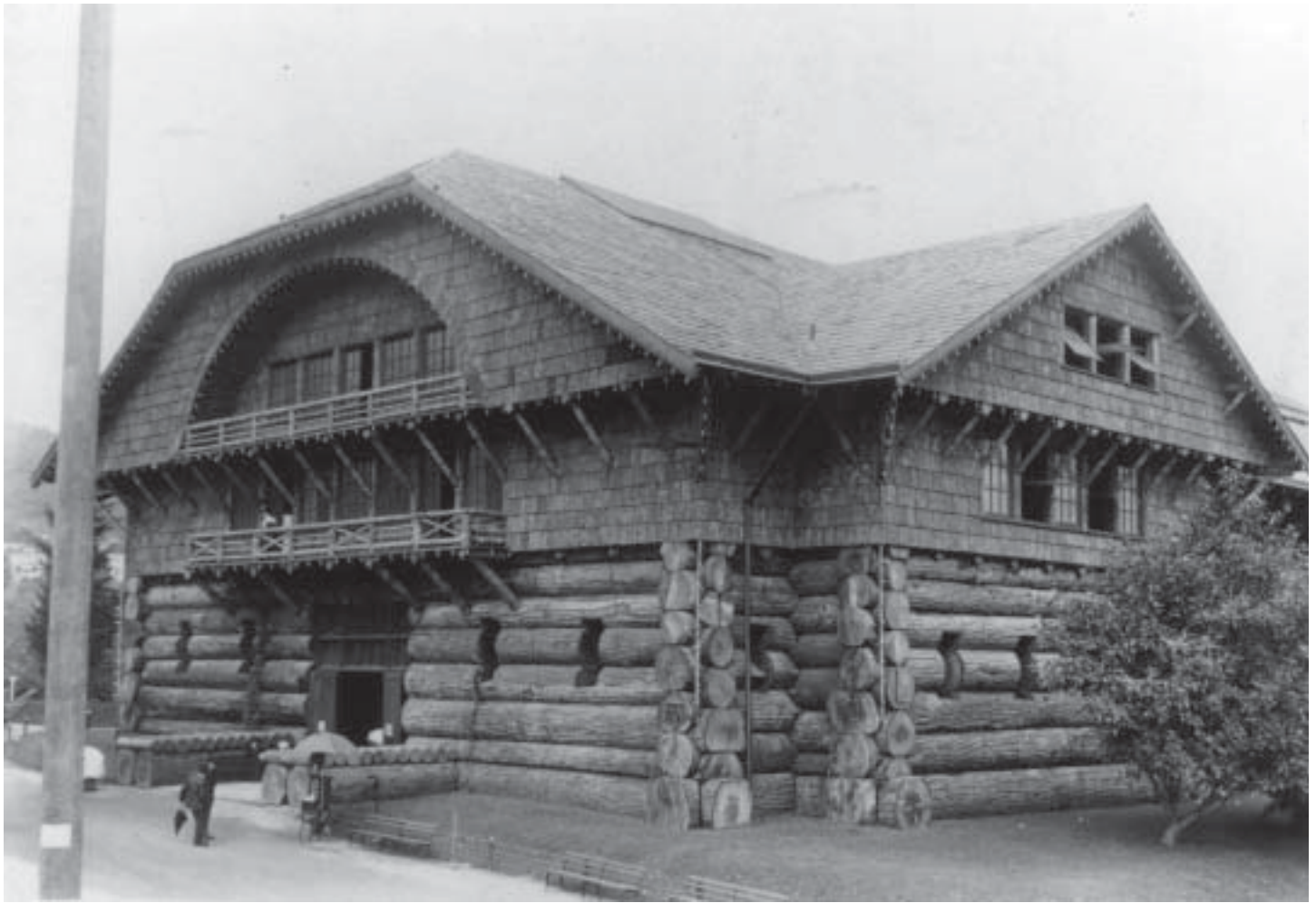
1905 Lewis & Clark Exposition, the forestry building. The structure was 102 feet wide by 205 feet long, and its great height was 70 feet. Construction of the building used two miles of five and six foot logs, five miles of poles and tons of shakes and cedar bark shingles.