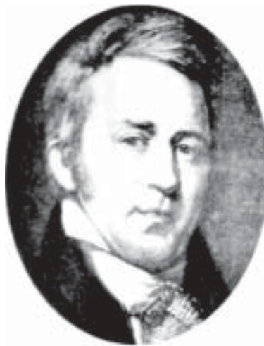
Capt. William Clark

Across the divide of nearly two centuries, it reminds us of what we as a people are capable of - for good or ill.