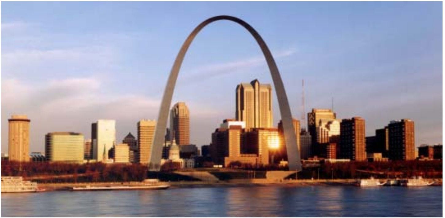
Gateway Arch, St. Louis. The Corps of Discovery headed up the Missouri River on May 22, 1804, and returned on September 23, 1806 to St. Louis. Their two-and one-half-year journey covered 8,000 miles.