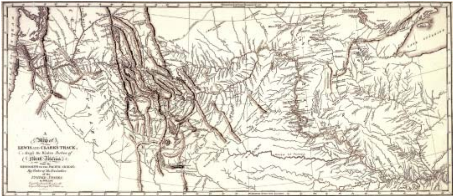
Map of the Lewis & Clark Track, copied from the original drawing of Capt. Clark, in "History of the Expedition under the Command of Captains Lewis & Clark" edited by Nicholas Biddle; Bradford and Inskip, Philadelphia, 1814.