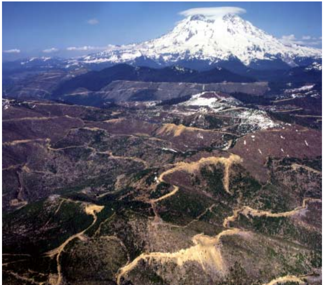
Mt. Rainier, clearcuts. Failure of the Lewis and Clark Expedition to find a water route to the Pacific Ocean would eventually lead to the transcontinental railroads. Encouraged by land grants awarded to railroads in the 1860s, timber companies started clear-cutting the Northwest in the late 1800s.

St. Louis Post-Dispatch, May 15, 1992, excerpted. Reprinted with permission of the St. Louis Post-Dispatch, copyright 1992.