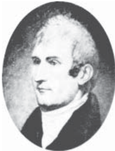
Capt. Meriwether Lewis

Sent by a young nation that itself would soon embark toward the Pacific, Lewis and Clark took our first transcontinental - "road trip." Since that time, road trips have held a special grip on the American imagination. Think of Huckleberry Finn , On the Road ,